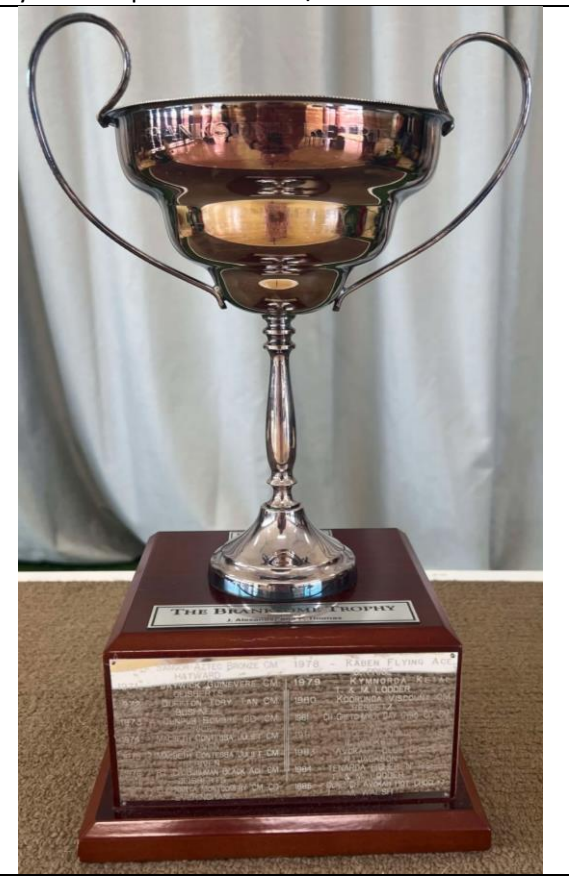
Branksome Perpetual – Restricted Retrieving Dog of the Year