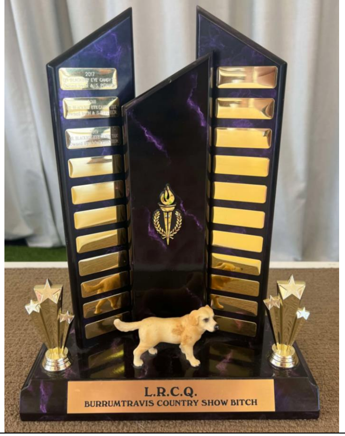
Burrumtravis Perpetual – Country Show Bitch of the Year