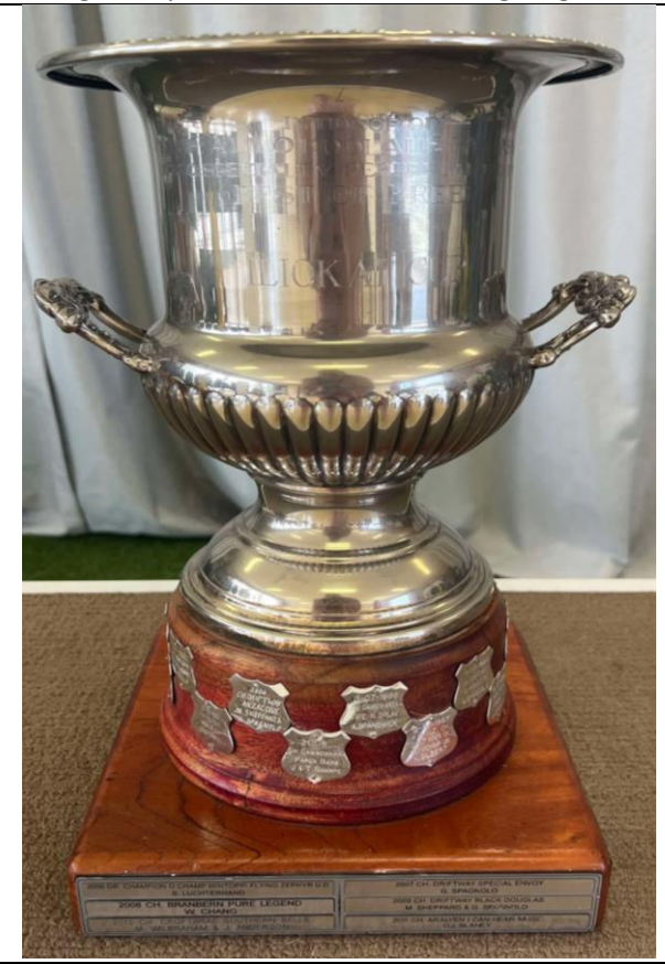
"Am CH. ALLII O'KOOLAU'S FANTASY" Perpetual Trophy - Best in Specialty Show