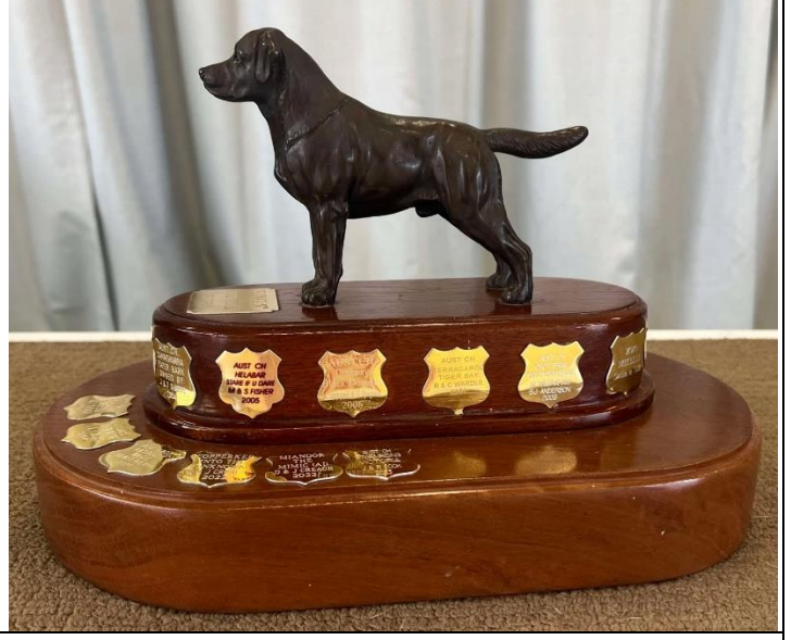
Slingun Perpetual – Up and Coming Labradors