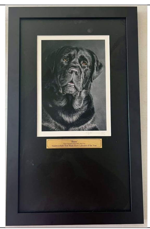
Sandwoodlabs Perpetual – Best Black Show Labrador of the Year