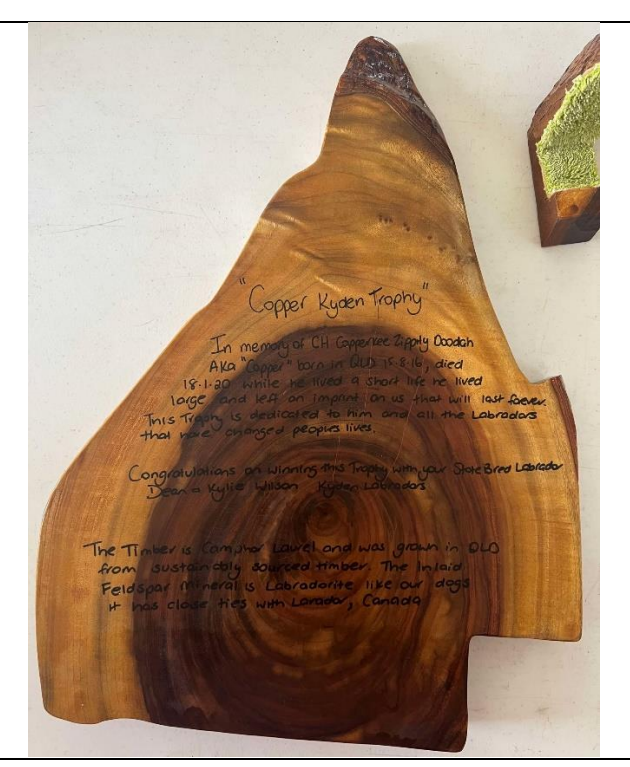
Kyden Perpetual – Best State Bred in QLD Show Labrador of the Year