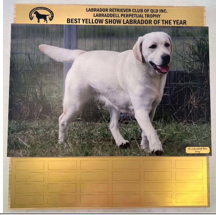
Labraddell Perpetual – Best Yellow Show Labrador of the Year