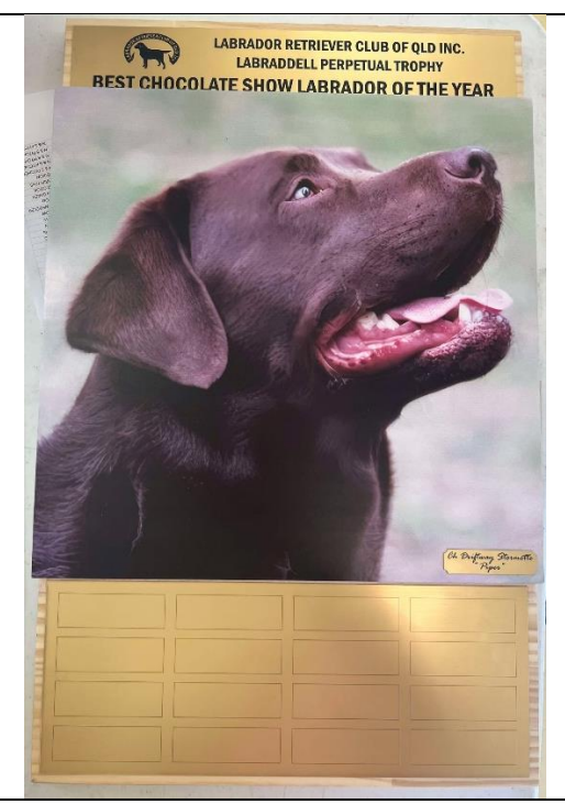
Labraddell Perpetual – Best Chocolate Show Labrador of the Year