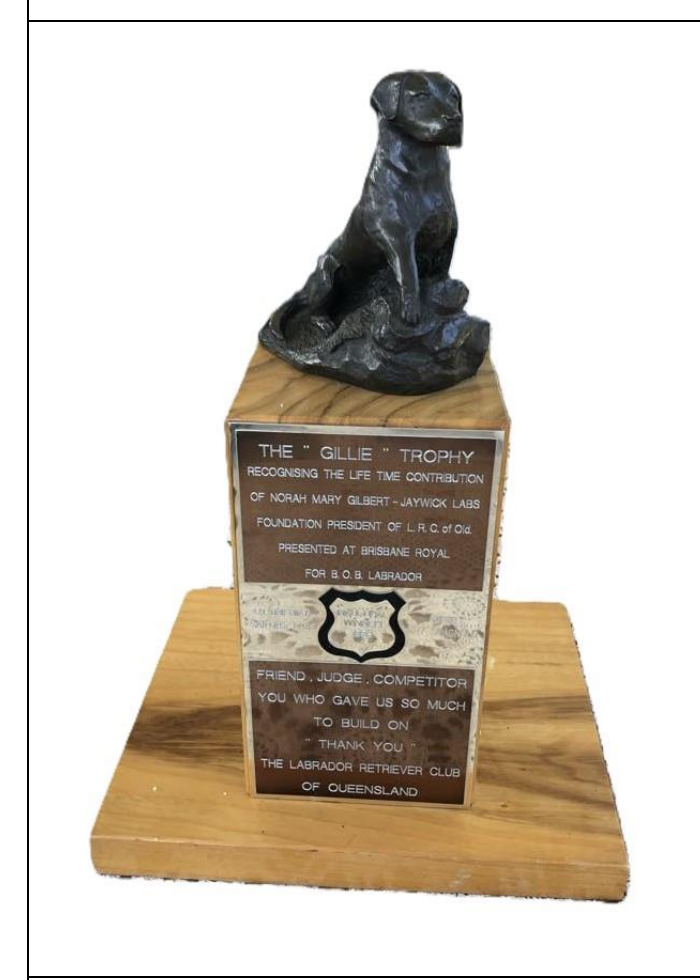
Best of Breed Brisbane Royal Show