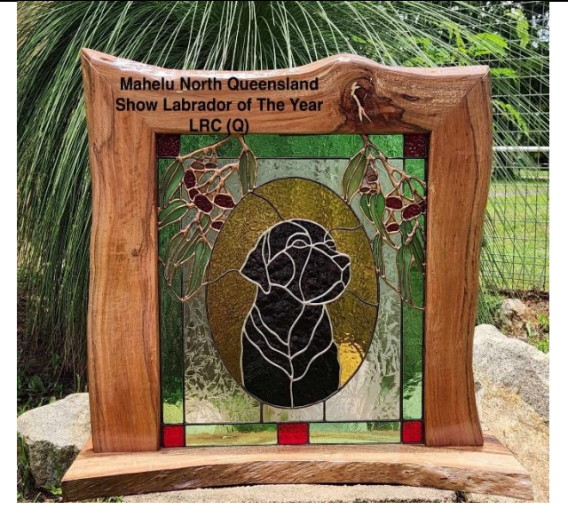
Mahelu Perpetual – North QLD Show Labrador of the Year