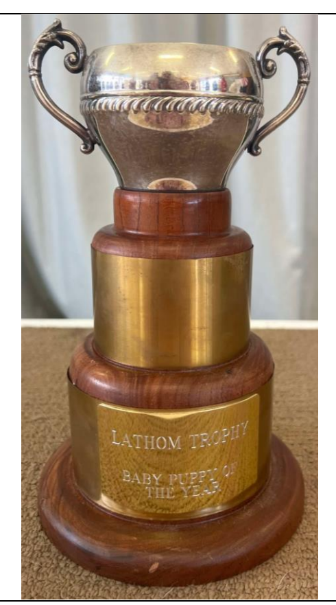
Lathom Perpetual – Baby Puppy of the Year