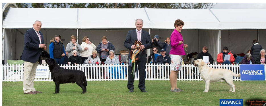
Reserve Challenge Dog (left) and Challenge Dog Winner (right).