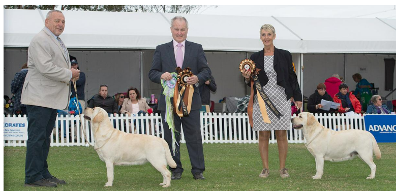
Challenge Bitch Winner (left) and Reserve Challenge Bitch (right).