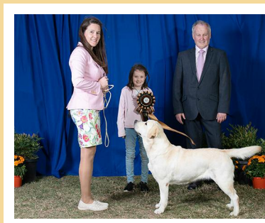
Opposite Inter. In Show Ch. Eraky Serengeti