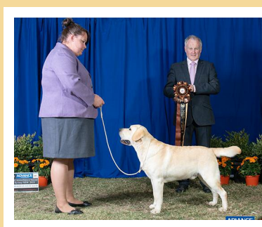
Opposite Junior In Show Ch. Airai Great Expectation (ai)