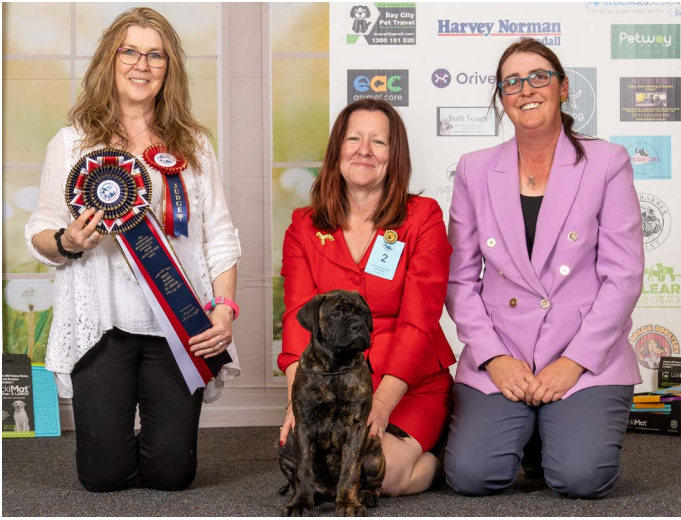
BEST BABY PUPPY IN SHOW BULLMIGHTY REACH OUT RICHARD Bullmighty Kennels