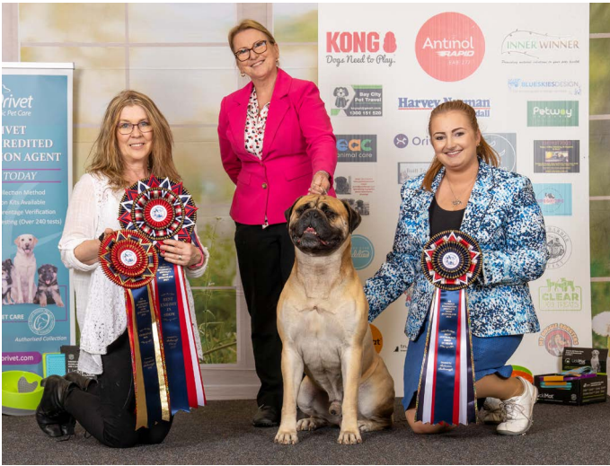
BEST IN SHOW, DOG CC, AUSTRALIAN BRED IN SHOW GR CH. MYMOOCH JUDGES QUEST M. & E. Edwards