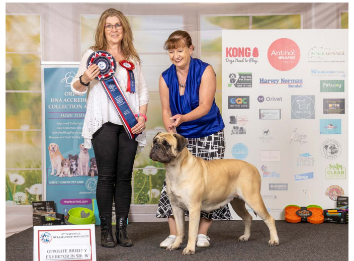
OPPOSITE BRED BY EXHIBITOR CH. BULLMASTER SCANDALOUS AFFAIR Bullmaster Kennels