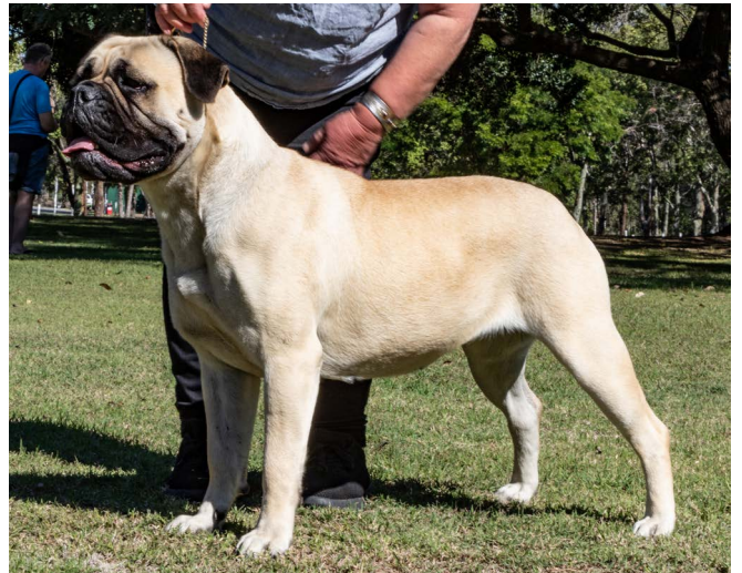
OPPOSITE JUNIOR BULLMIGHTY Q TINY DANCER Bullmighty Kennels