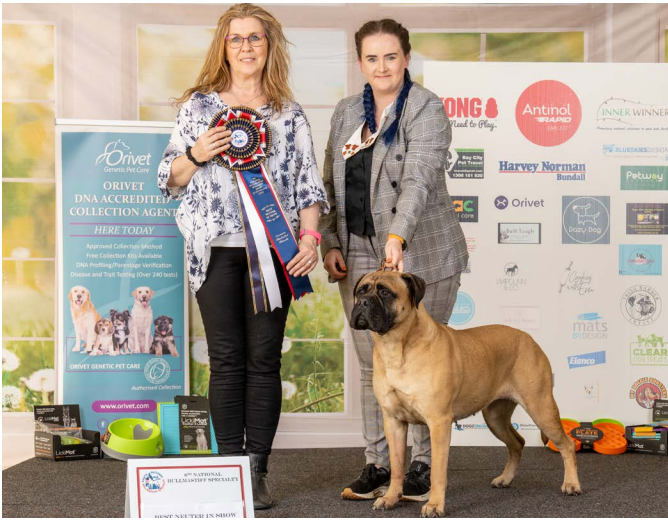
BEST NEUTER IN SHOW CH NEUT. CH. BULLMIGHTY FAIRIES WEAR BOOTZ (AI) Bullmighty Kennels