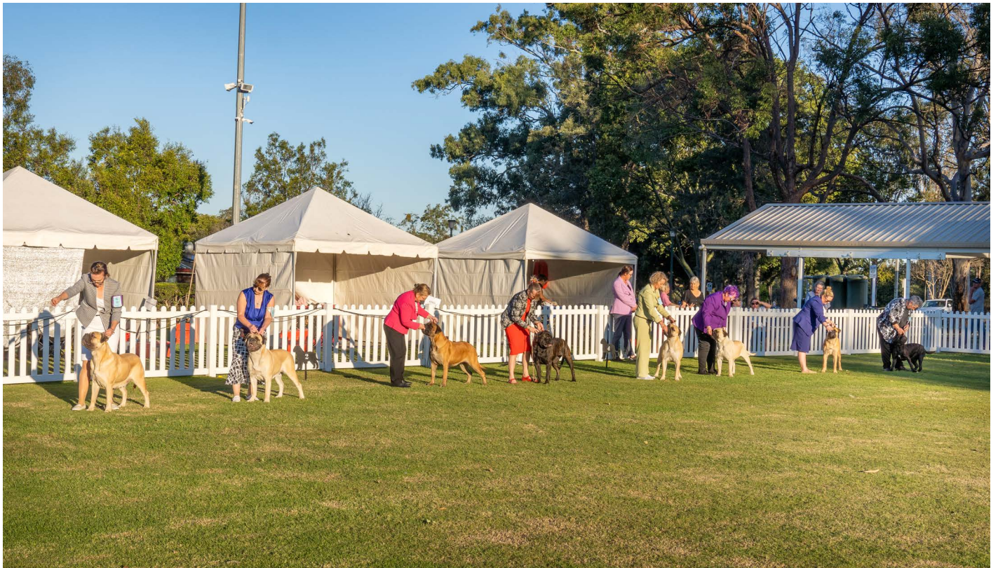
BITCH CHALLENGE LINEUP

Clear fawn, good pigmentation, good stop, dark eye. A good size girl with a decent reach of neck, level topline, good angles front and rear. Good profile movement but moves a bit close coming and going.