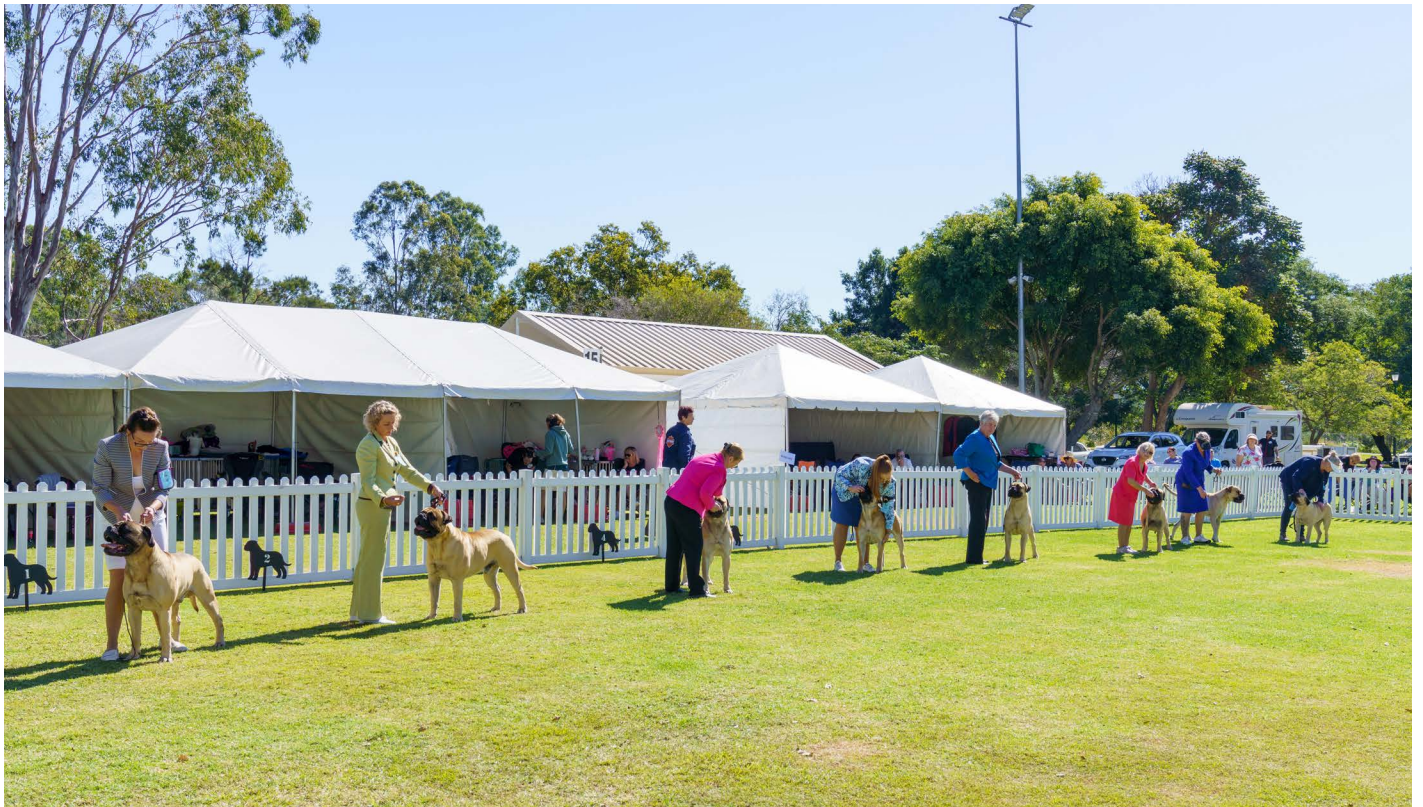
DOG CHALLENGE LINEUP

Fawn boy short coupled with a decent topline, good tight feet, strong pasterns. Moves close at rear, a more pleasing side profile movement. A very happy boy.