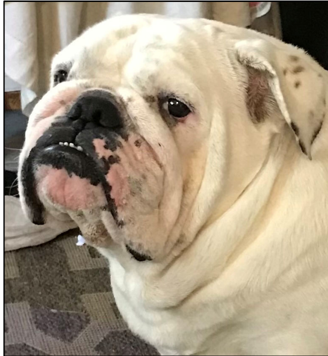
owned by Ann Small