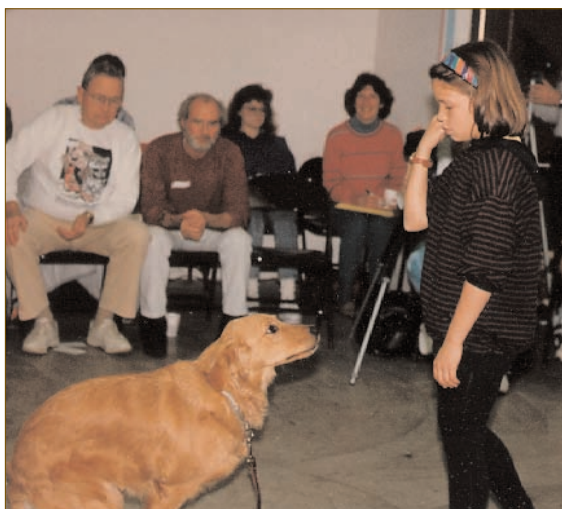
By coming when called and sitting on request, a puppy demonstrates willing compliance and shows respect to his trainer—a child.

Give children tasty treats such as freeze-dried liver as well as kibble to use as lures and rewards during handling and