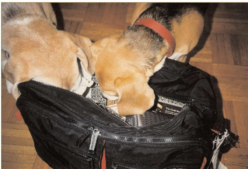
Beagles just begging to "unpack" a visitor's unattended luggage

Most doggy "disobedience" and wanton house destruction occurring in the owner's absence has nothing to do with separation anxiety. In fact, separation relief might be a more precise and descriptive term. The dog chews, digs, barks, and soils the house only when the owner is absent because he has learned it would be foolhardy to indulge in these pastimes when the owner is present. Owner-absent misbehavior is an indication that the owner has tried to suppress normal and natural dog behaviors with punishment, rather than teaching the dog how to behave—namely, how to express his basic doggy desires in an acceptable fashion. Often the term separation anxiety is an excuse for a dog who is simply not yet housetrained or chewtoy-trained.