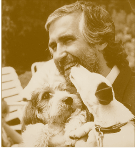
Puppy cuddle time.

Many adult dogs are more fearful of men than they are of women. So invite over as many men as possible to handle and gentle your puppy. It is especially important to invite men to socialize with your puppy if no men are living in the household. Make sure you teach all male visitors how to handfeed kibble to lure/reward your pup to come, sit, lie down, and roll over. Add a few extra tasty treats to each male visitor's bag of training kibble so that your puppy forms a fond and loving bond with men.