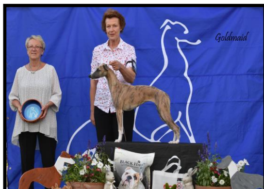
Best Minor Puppy in Show