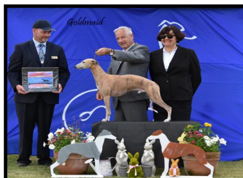
R/Up Best Exhibit in Show