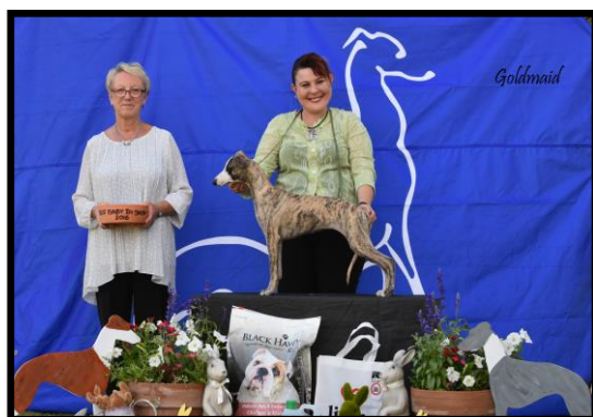
Best Baby Puppy in Show