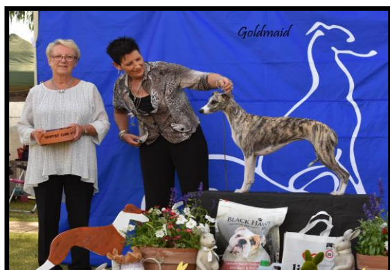
Best Australian Bred in Show