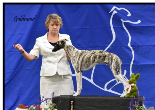
Best Opp Puppy in Show