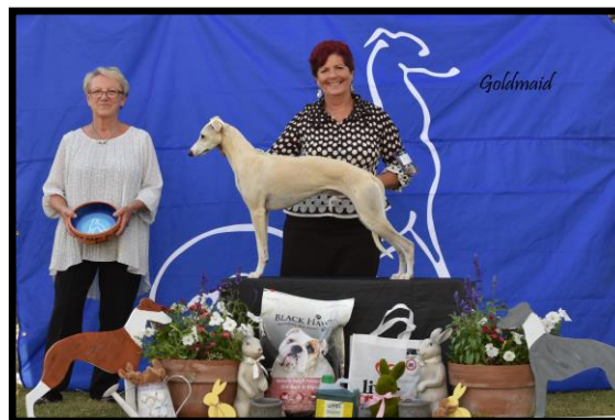
Best Opp Junior in Show