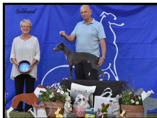
Best Opp Baby Puppy in Show