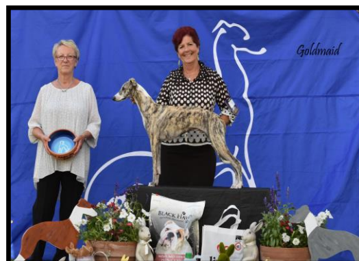
Best Opp Minor Puppy in Show