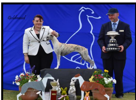
Best Exhibit in Show