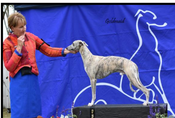
Best Opp Australian Bred in Show