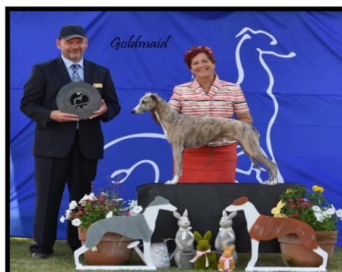
Best Opp Intermediate in Show