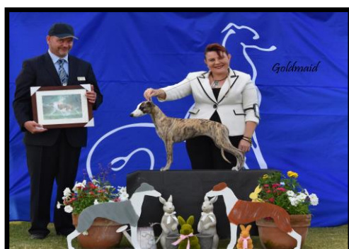
Best Baby Puppy in Show