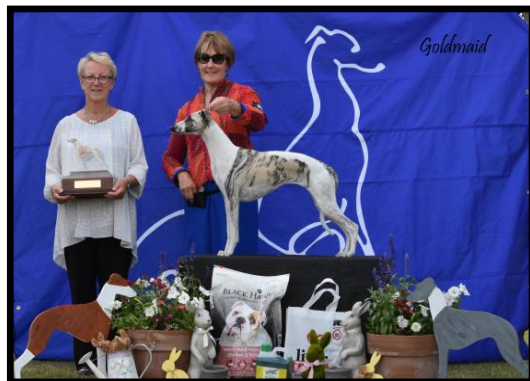
Best Exhibit in Show