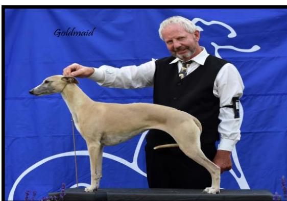
Best Opp Open in Show