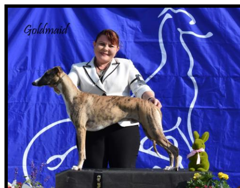
Best Opp Puppy in Show