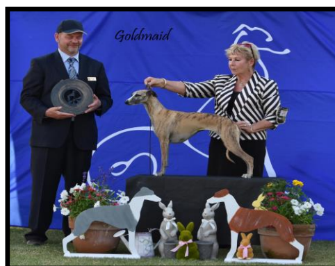
Best Opp Open in Show