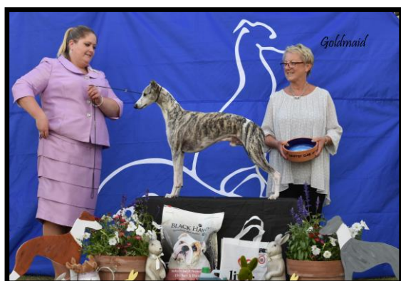
Best Open in Show