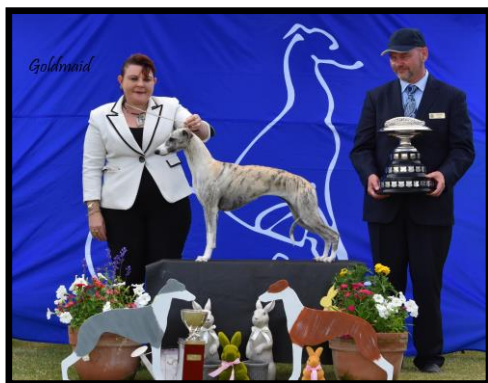
Best Australian Bred in Show