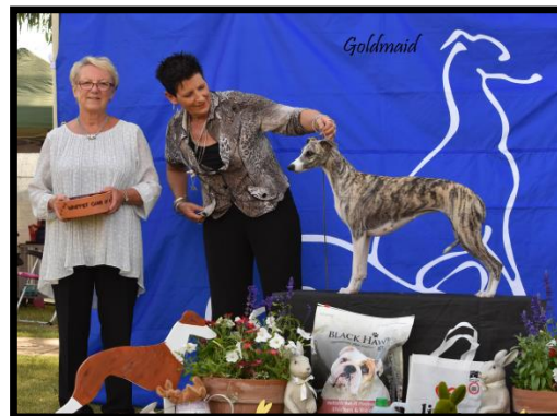
Runner Up Best Exhibit in Show