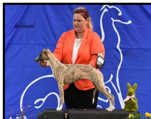
Best Opp Minor Puppy in Show