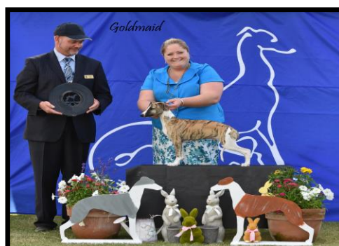
Best Opp Baby Puppy in Show