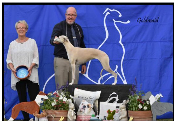
Best Intermediate in Show