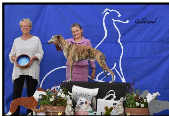
Best Opp Intermediate in Show