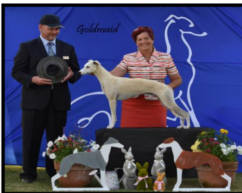
Best Opp Junior in Show