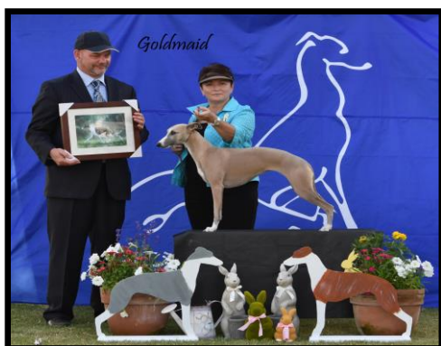
Best Intermediate in Show