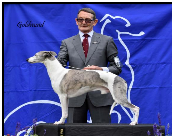
Best Opp Veteran in Show