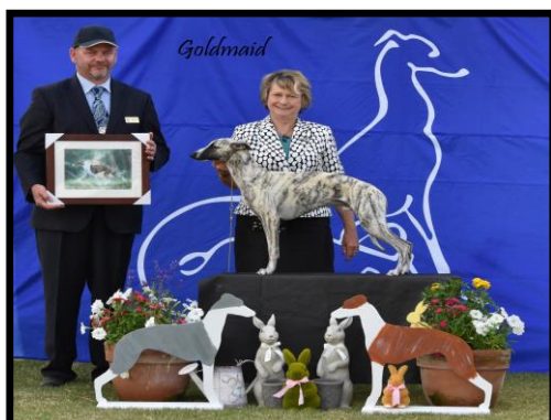
Best Minor Puppy in Show