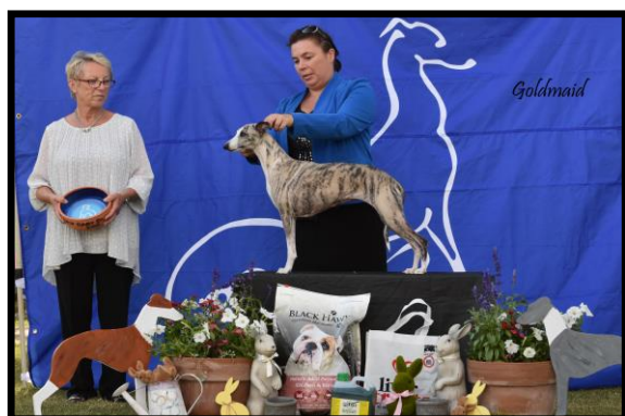
Best Neuter in Show