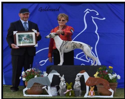
Best Junior in Show