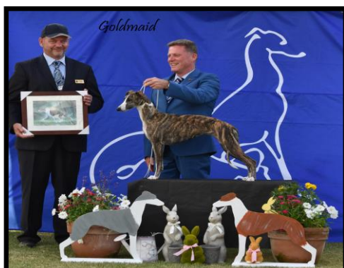
Best Puppy in Show