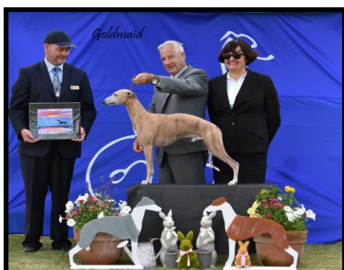
Best Open in Show