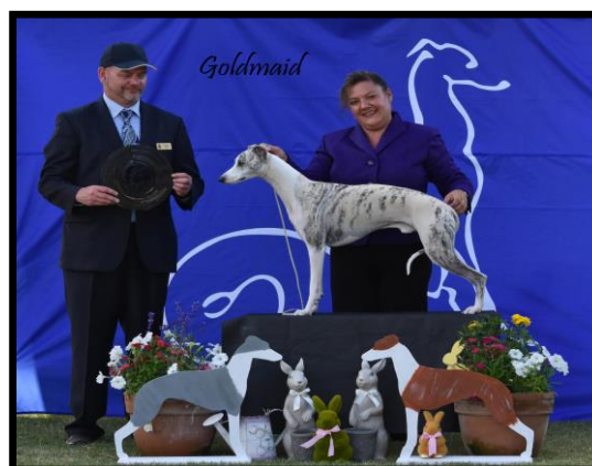
Best Opp Neuter in Show