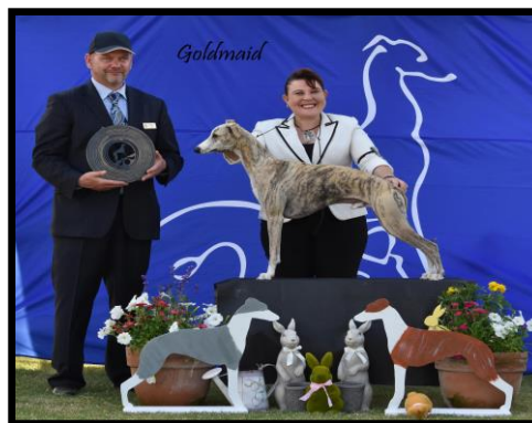
Best Opp Australian Bred in Show