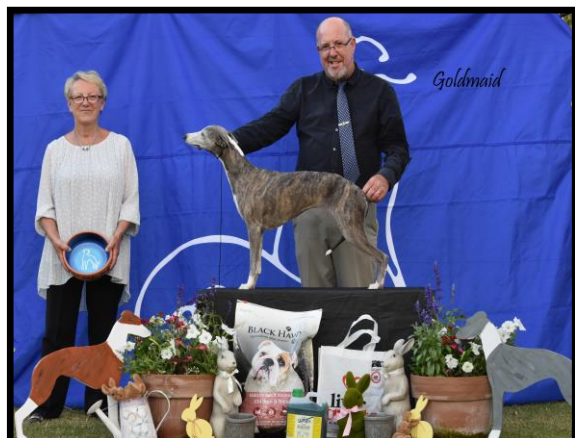
Best Veteran in Show