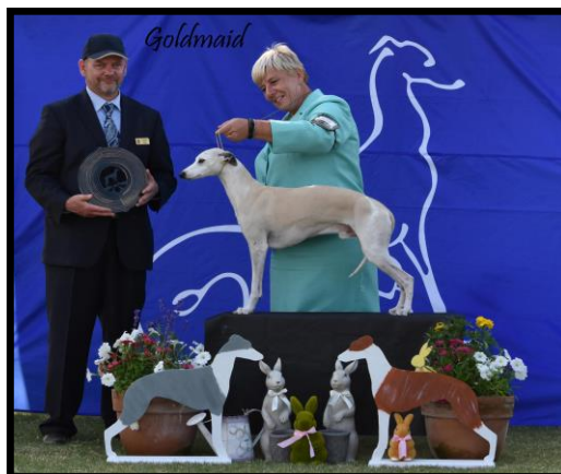
Best Opp Veteran in Show