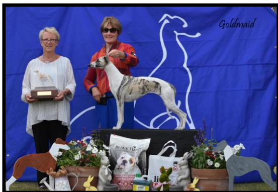
Best Junior in Show