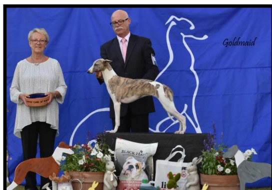
Best Puppy in Show