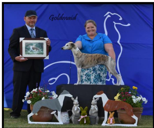
Best Veteran in Show