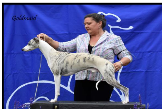
Best Opp Neuter in Show

www.CoolingApparel.com.au +61 (03) 5998 8336