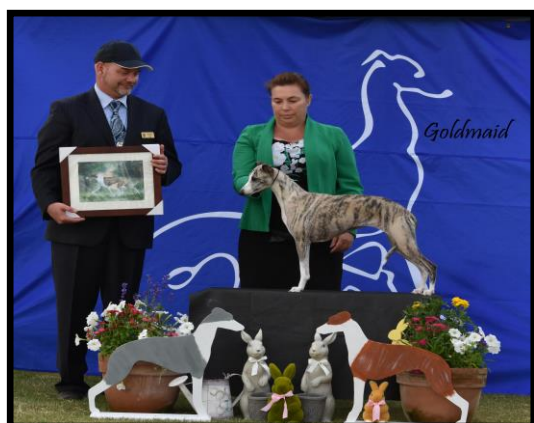
Best Neuter in Show