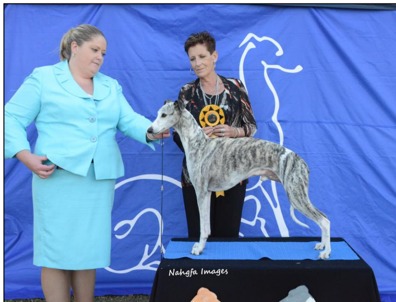
RESERVE DOG CHALLENGE & BEST AUSTRALIAN BRED IN SHOW SUP CH BEAUROI BLAME IT ONTH REIGN T & J MCNEILL