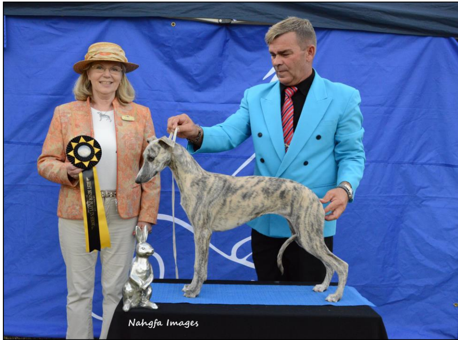
BEST MINOR PUPPY IN SHOW LAVUKA ONCE APON A TIME G MARK