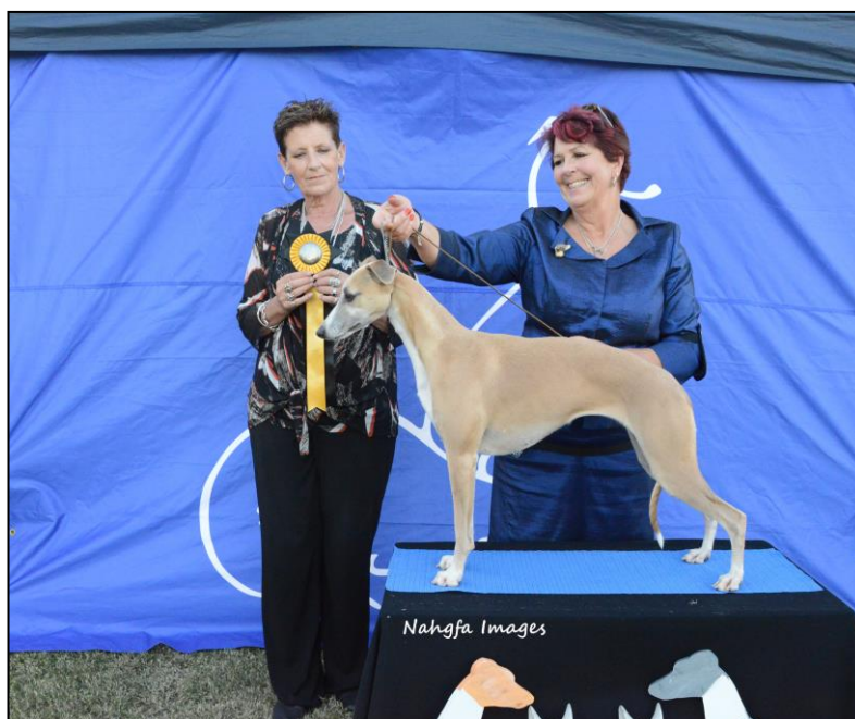
BEST OPPOSITE AUSTRALIAN BRED IN SHOW CH RIDGESETTER SUMMER LOVING J & T COMERFORD