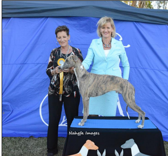
BEST OPPOSITE MINOR IN SHOW SHAWTHING TELL IT LIKE IT IS V SHAW