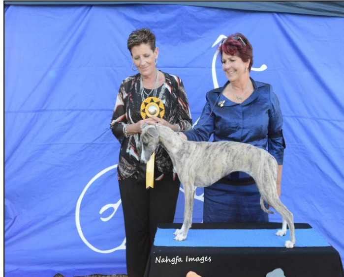
BEST MINOR PUPPY IN SHOW RIDGESETTER LUCKY GAMBLE J & T COMERFORD