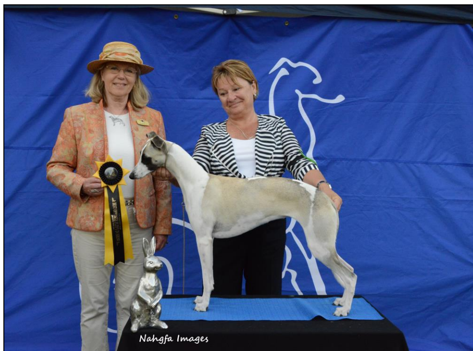
BEST OPPOSITE PUPPY IN SHOW INGWE PRETTY WOMAN A SAUNDERS