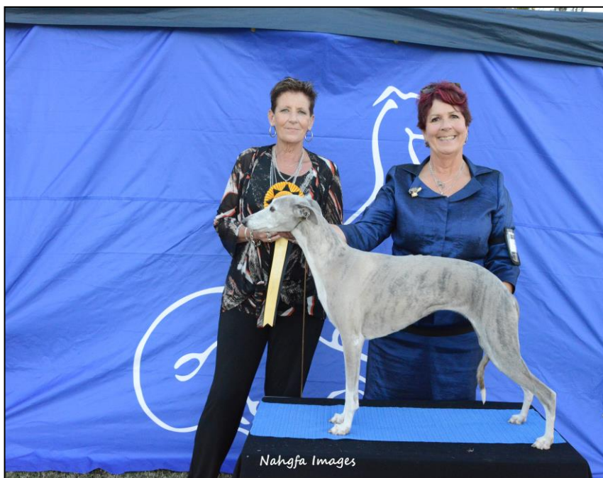
BEST NEUTER IN SHOW SUP CH RIDGESETTER ETAIN J & T COMERFORD