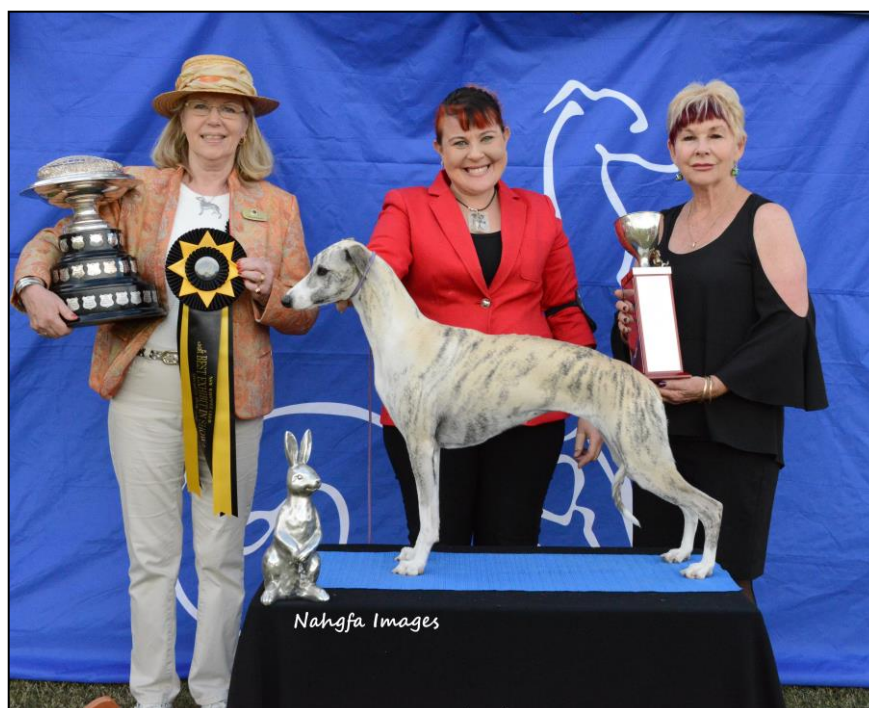
BITCH CHALLENGE, BEST EXHIBIT IN SHOW & BEST OPEN IN SHOW SUP CH TAEJAAN WALKING ON AIR NJ RULE STEELE & S TURAY