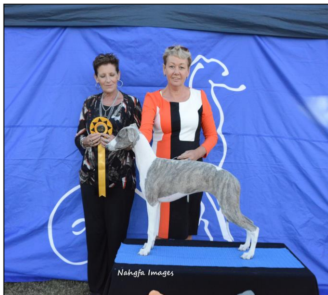
BEST BABY PUPPY IN SHOW TAEJAAN LOVE ACTUALLY M EATHER, W HARBUTT & NJ RULE STEELE