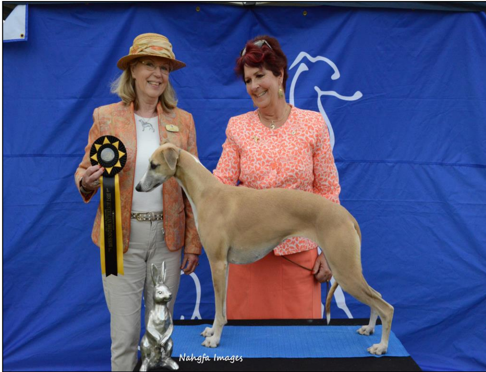
BEST AUSTRALIAN BRED IN SHOW CH RIDGESETTER SUMMER LOVING J & T COMERFORD