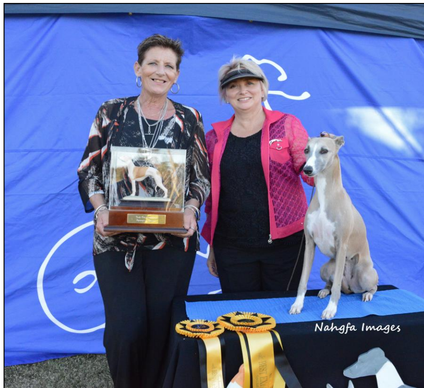
BITCH CHALLENGE, BEST EXHIBIT IN SHOW & BEST OPEN IN SHOW CH RIDGESETTER FOLLOW THE DREAM K CLEAVE