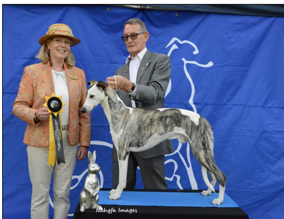
BEST OPPOSITE JUNIOR IN SHOW INGWE TEARS OF A CLOWN P MORE & P GRIFFITHS