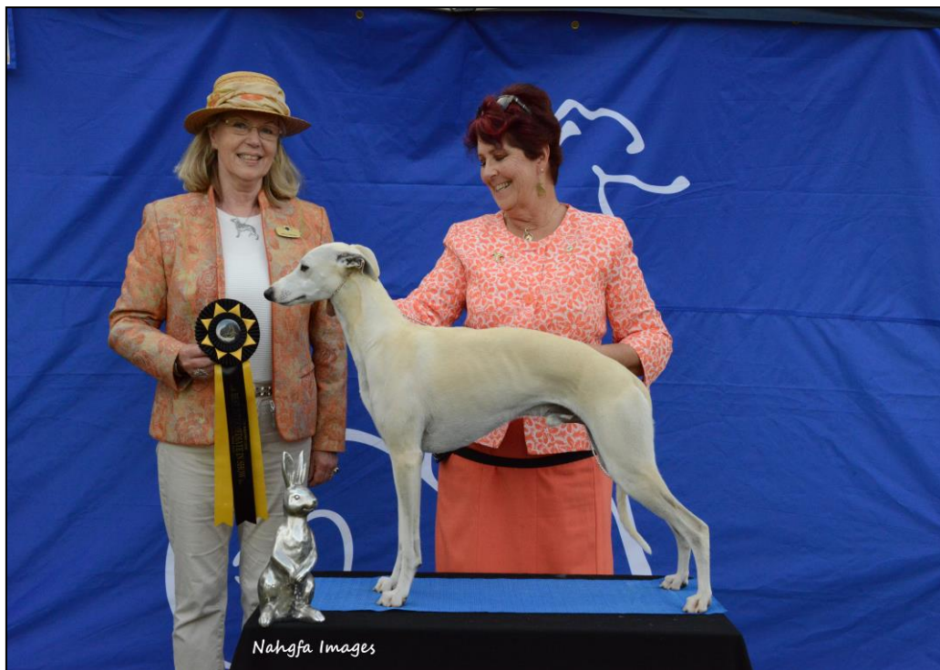
BEST INTERMEDIATE IN SHOW CH OZRHODE CELTIC SIMPLY CLASS J & T COMERFORD