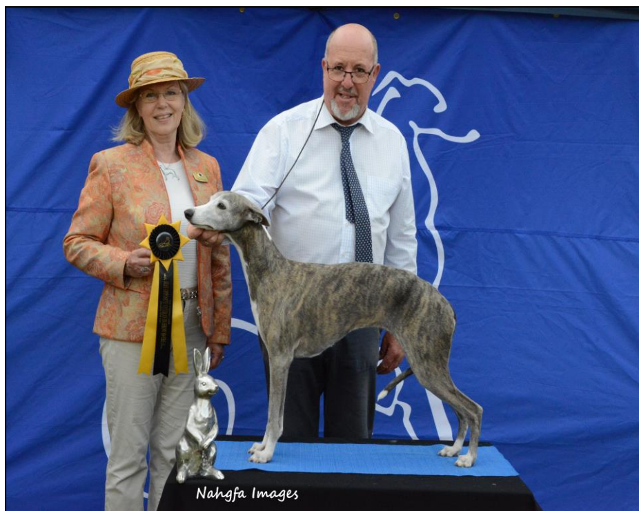
BEST OPPOSITE VETERAN 10+ YEARS IN SHOW NZ CH, CH DACHLAH SILVER STAR G & C SKENE