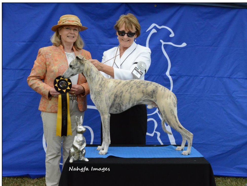
BEST OPPOSITE AUSTRALIAN BRED IN SHOW CH GUNARRYN PACKED WITH LOVE F DYER