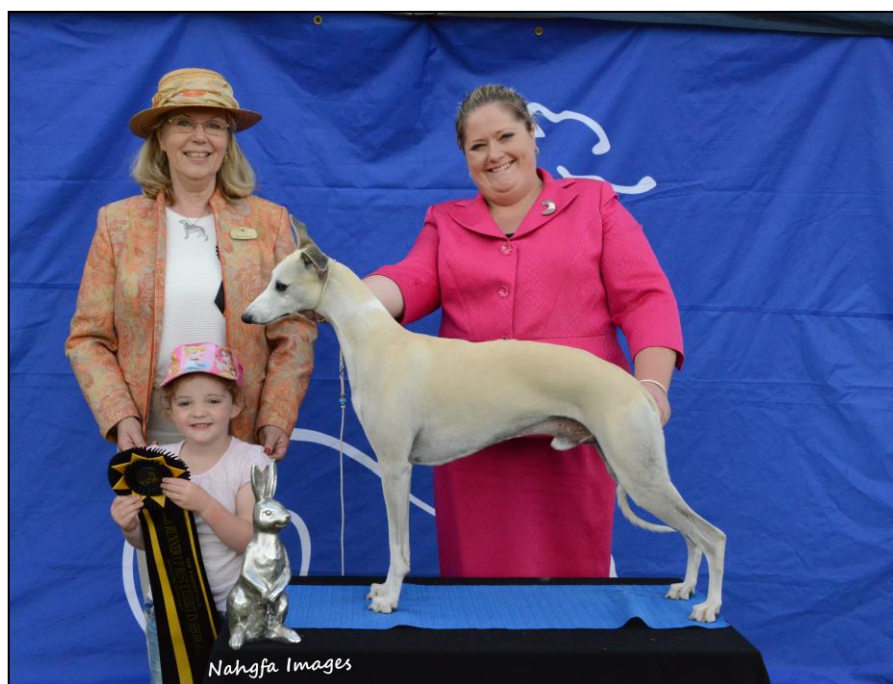
DOG CHALLENGE, RUNNER UP TO BEST IN SHOW & BEST OPPOSITE OPEN IN SHOW NZ CH, CH BEAUROI PAX A PUNCH T & J MCNEILL