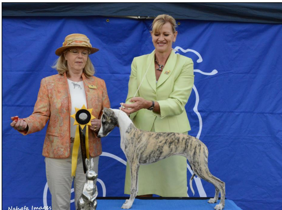
BEST OPPOSITE BABY PUPPY IN SHOW SHAWTHING AVE MARIA (AI) V SHAW