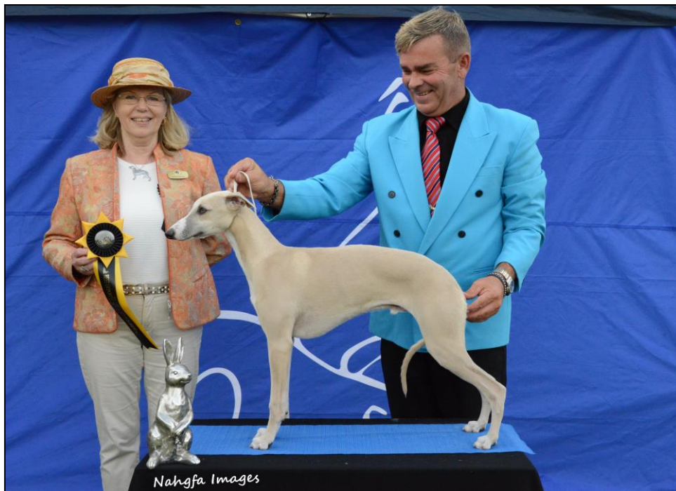
BEST OPPOSITE MINOR PUPPY IN SHOW LAVUKA SINGING IN THE RAIN G MARK