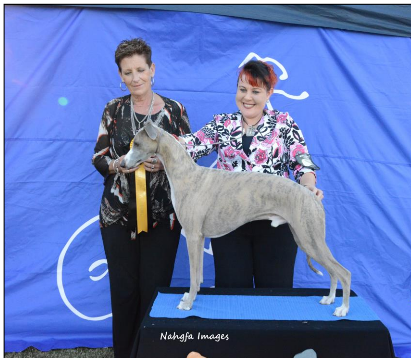
BEST OPPOSITE OPEN IN SHOW CH TAEJAAN SET FIRE TO THE RAIN NJ RULE STEELE & S TURAY