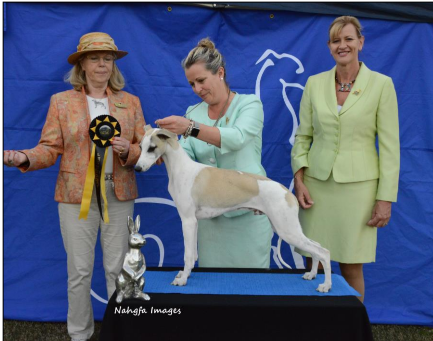
BEST BABY PUPPY IN SHOW SHAWTHING IM A LUIGI (AI) V SHAW