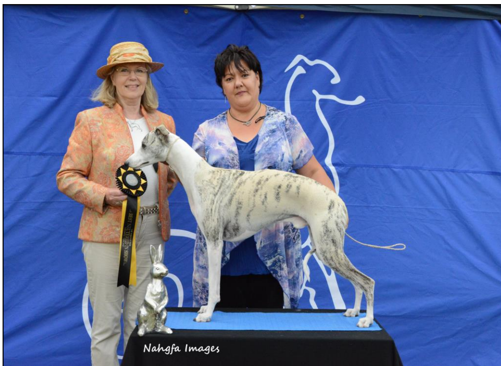
BEST NEUTER IN SHOW NEUT CH ISILWANE KING OF THE PLAINS L FOLDI