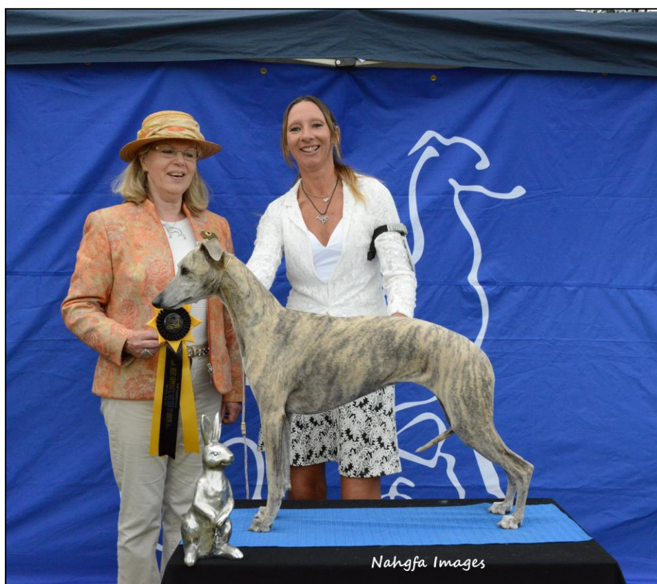
BEST OPPOSITE NEUTER IN SHOW CALAHORRA SUN LIZARD J HALL