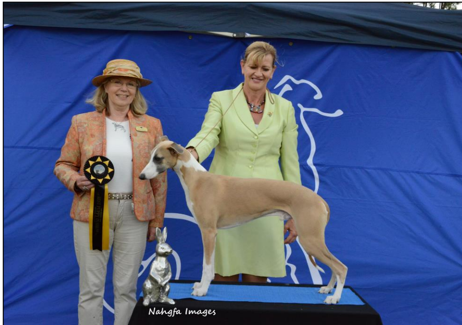
BEST PUPPY IN SHOW BONNYMEAD FROZEN IN TIME (AI) V SHAW & N HARRIS