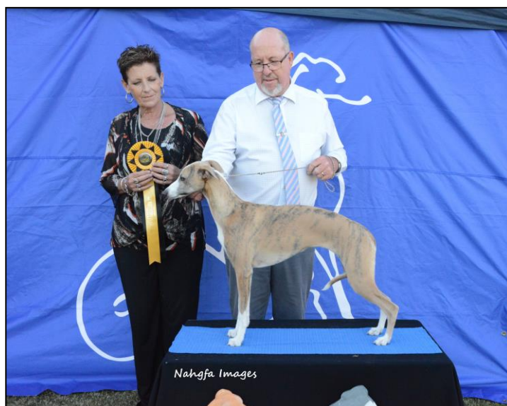
BEST PUPPY IN SHOW BENBRIDGE I JUMPED THE FENCE TO KANA-KA (IMPNZ) G & C SKENE