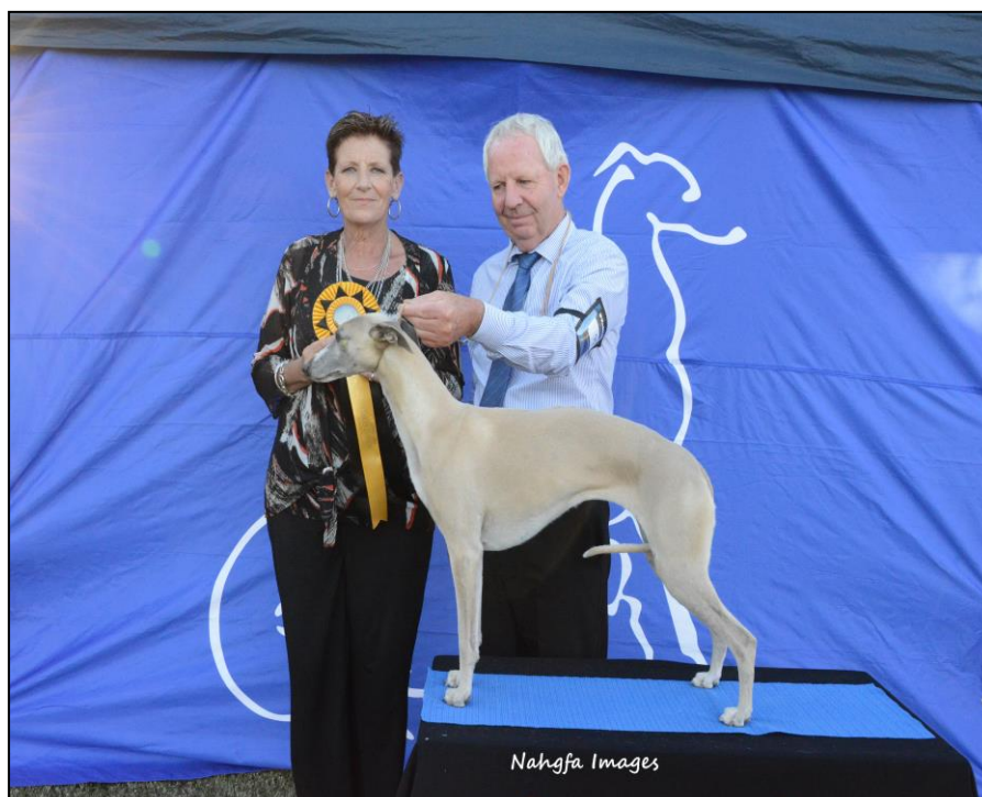
BEST VETERAN 7-10 YEARS IN SHOW SUP CH NABIHAH PEPPAS TIGRA M & S PATTERSON