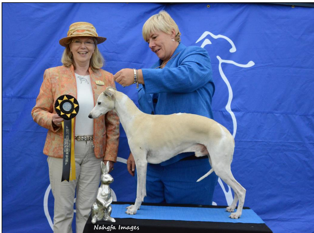
BEST VETERAN 10+ YEARS IN SHOW CH ISILWANE JOLLY ROGER L BARRENGER