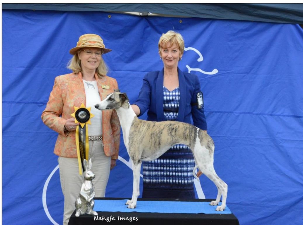
BEST OPPOSITE INTERMEDIATE IN SHOW CH GOODWILL GIRL ON FIRE S & D ALBERT