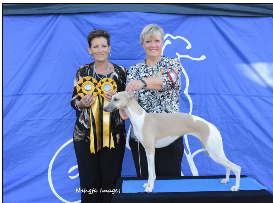
RESERVE BITCH CC, RUNNER UP TO BEST EXHIBIT IN SHOW & BEST INTERMEDIATE IN SHOW ALARVES ROYAL ENCOUNTER J MCKERNAN