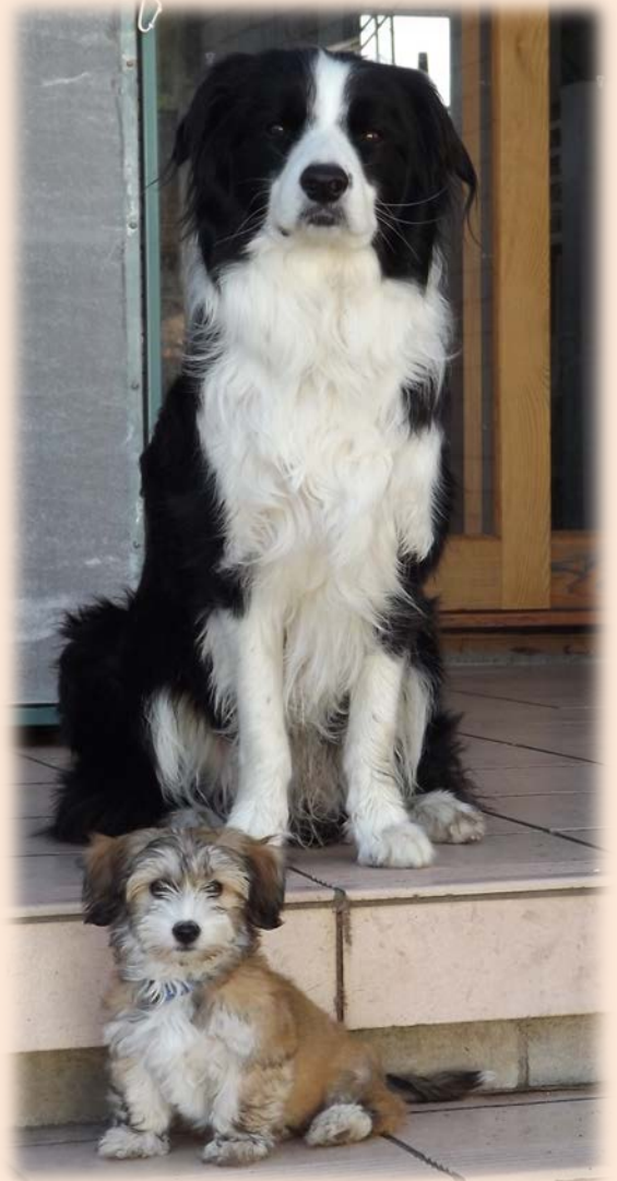
Me and Shadow - my bestest friend