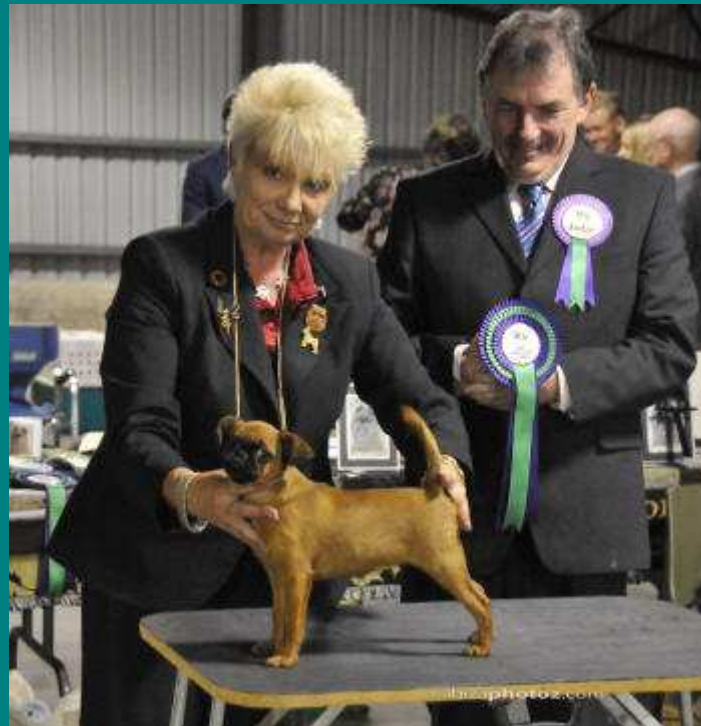
Best Baby in Show

1st No 20 STATUESQUE CANT GET ENUFF RUFF Smooth bitch with a well made solid shapely body, nice depth of rib, high tail set and nice neck carriage giving her a good outline standing or moving. Good short coat and rich colour. Full of confidence and moved well. Neat ears and good size to expressive eyes would hope she broadens a little in muzzle as she matures.