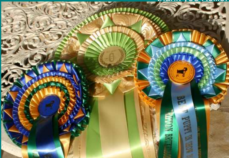
Rosettes from GBBA (English Griffon Club) and Dutch Toy Club – thank you for your support too!