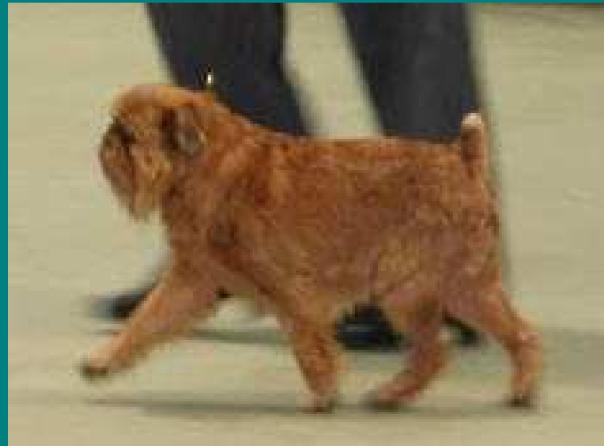
Best Head and Best Red in Show

2nd No 9 CH ARMORGRIF AMON RA Mature RR with beautiful head with width and turn up to underjaw, great nose pad and large expressive eyes. Very nice in depth of rib cage, good bone, and short compact body giving an attractive profile but not as strong in topline as 1st. Strong harsh coat though not quite at it's best he was cleverly presented. Moved with a nice balance of reach and drive.