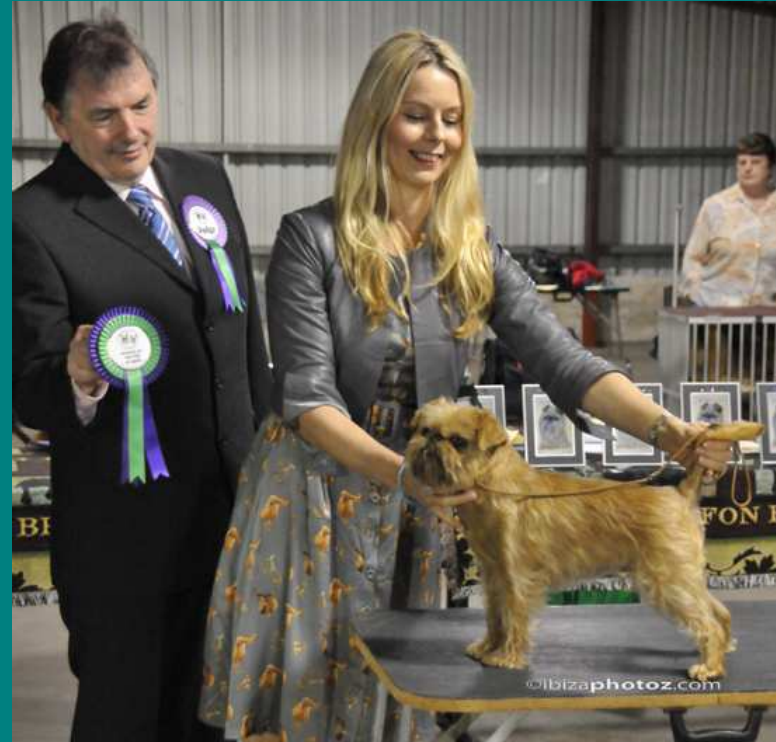
Best Opposite Sex Neuter,