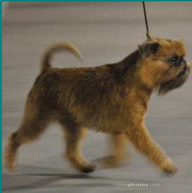
RCC dog, and RUBIS & Best Aust Bred in Show

1st No 6 CH STATUESQUE PUMPER NICKEL Extremely impressive dog R/R Dog on the smaller end of the size scale loved his strong balanced proportions in body, lovely head carriage positive action on the move and animated 'showmanship, nicely high set tail, good depth of rib cage, harsh coat very well presented. Large head with neat enough ears and good turn up of chin to large nose pad with plenty of width between large expressive eyes. Unfortunately for him he just missed out in the final challenge in the main because I felt him a little less mature than the winner, and to be very picky he has a shorter nose than the BIS which in the revised standard put him a shade behind today.