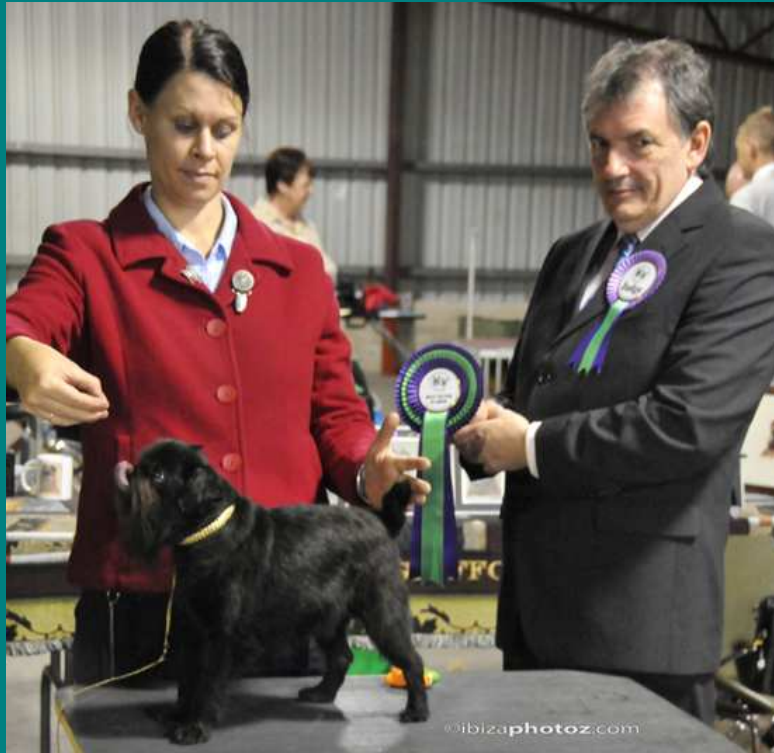
Best Neuter in Show