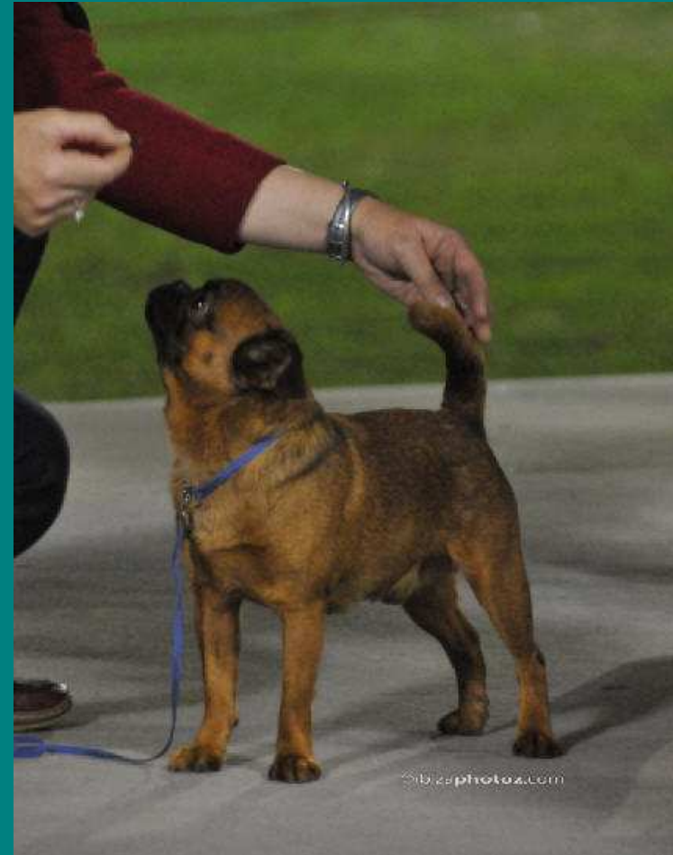
Best Opposite Junior in Show