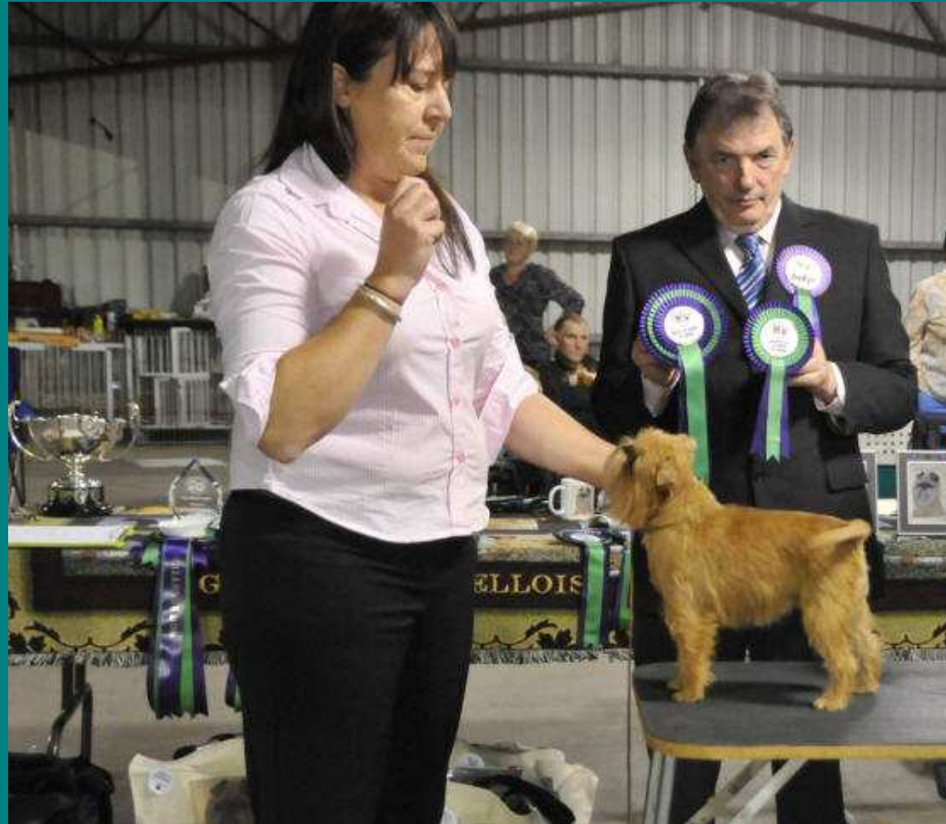
Reserve Bitch CC & Best Junior in Show

1st No 23 WITCHGRIFF MISS PEBBLES R/R Lovely body shape, short and compact, nicely rounded in rib, strong level topline with high set tail, nice neck giving good head carriage. Lovely size to head, neat well carried ears dark expressive eyes of good size and broad well turned up underjaw. Harsh well prepared coat and nicely balanced action on the move.