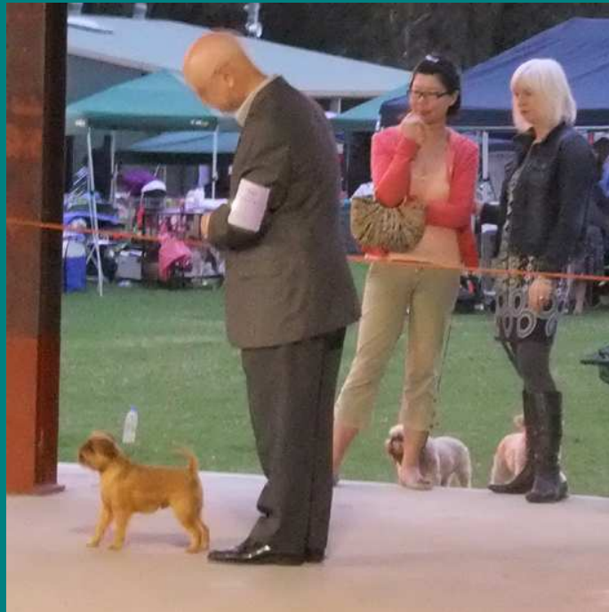
Best Puppy in Show

1st No1 STATUESQUE WILLIAM WOMBAT R/R young puppy with and excellent shape, with short back and high tail set, lovely rounded rib cage for a baby, harsh coat and stylish mover in profile and strong action moving away, perhaps a little high in front action but I do not think it an issue at this stage of his development. Very attractive head and expression with large head, eye and nose pad along with neat ears. Harsh coat and well presented.