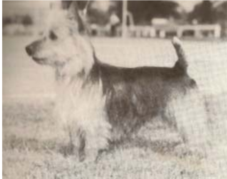
Figure 6 Well proportioned male

A typical characteristic is the graceful, slightly arched neck. In a first class specimen this arched neck can do much to enhance the proud carriage of the head. A short, stuffy neck does not belong to the Australian Terrier.