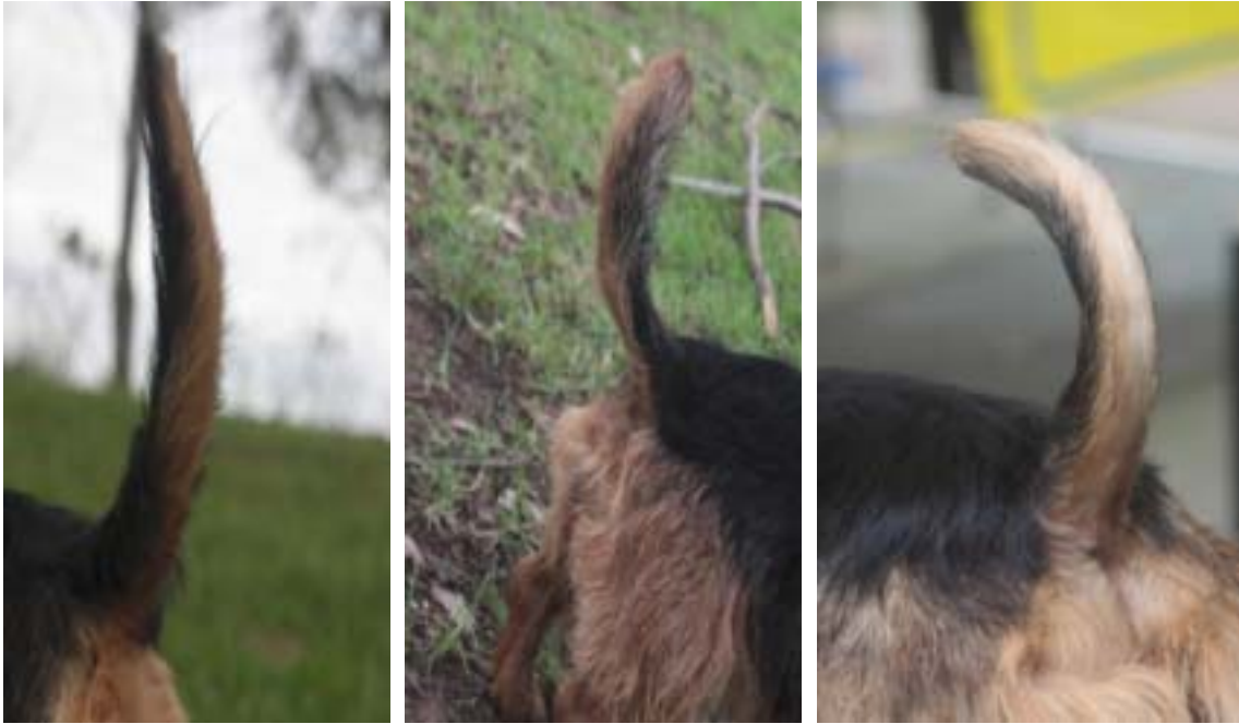
Figure 8 Typical undocked tail