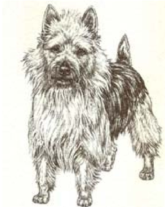
Figure 7 Correct front

The elbows should be held securely in place by strong pectoral muscles. If these muscles are soft and flabby the elbow appears slack and this is referred to as "out at elbow".