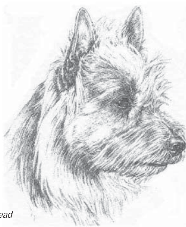
Figure 2 Typical head