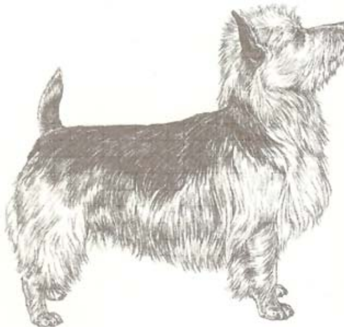
Figure 1 - Typical of the breed

A breed standard is the guideline which describes the ideal characteristics, temperament, and appearance of a breed and ensures that the breed is fit for function with soundness essential. Breeders and judges should at all times be mindful of features which could be detrimental in any way to the health, welfare or soundness of this breed.