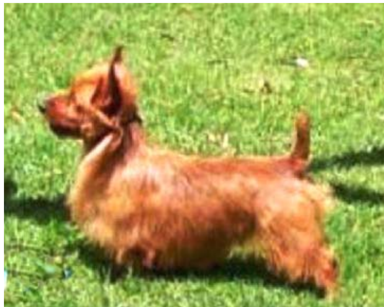
Figure 11 Mature Red