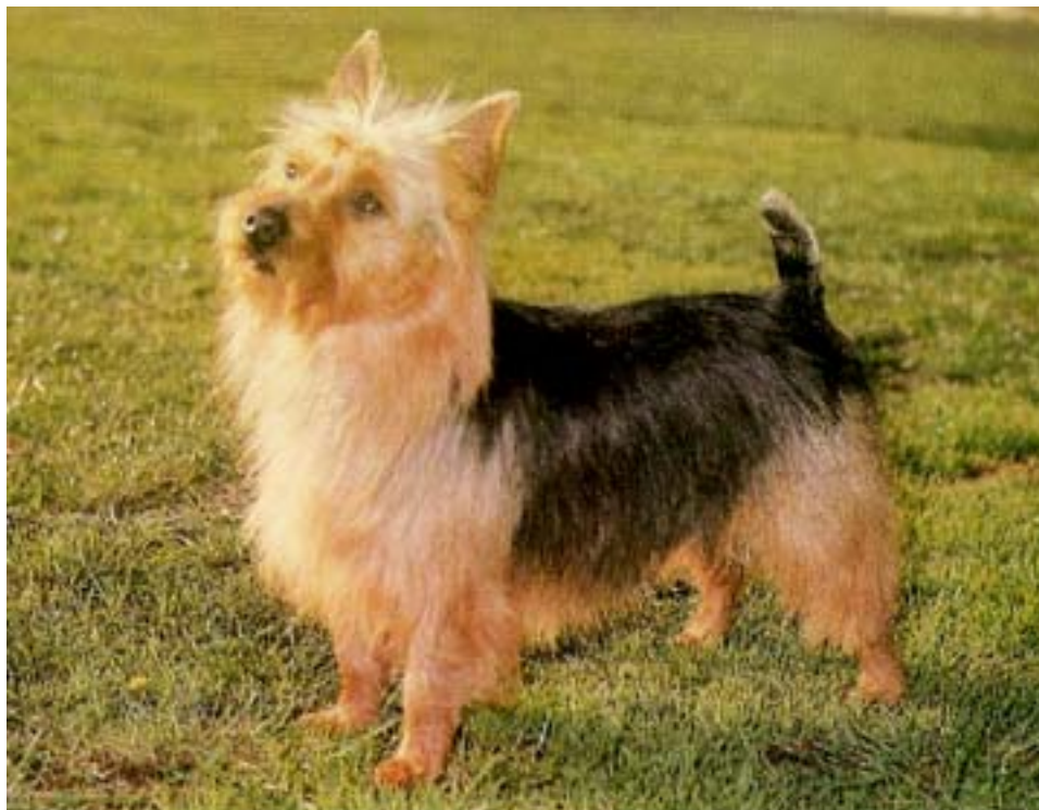
Figure 3 Outstanding male