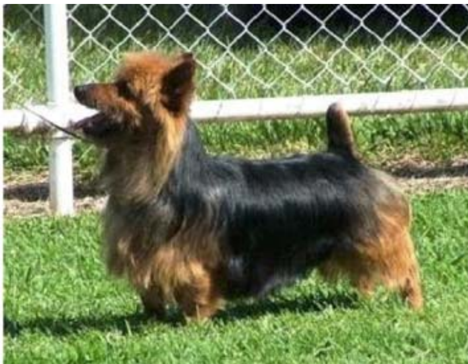
Fig. 16 Excellent body proportions

Don't let the words "rugged appearance" mislead you into thinking we want a dog that is shaggy and unkempt in his appearance. Remember we are talking of the dog in terms of judging him and therefore expect to see a well groomed dog that is capable of standing up alongside other terriers and for this reason must be presented in the best possible manner to enhance him and his prospects of winning. He is not a dog which looks at you with a soft and mild expression seen in some other breeds, his small dark eyes assist greatly in giving him that hard bitten look and by virtue of the fact that he is a terrier he must show that alertness and sharpness associated with terriers and this, along with his harsh, dense coat gives him that rugged appearance called for in the standard.