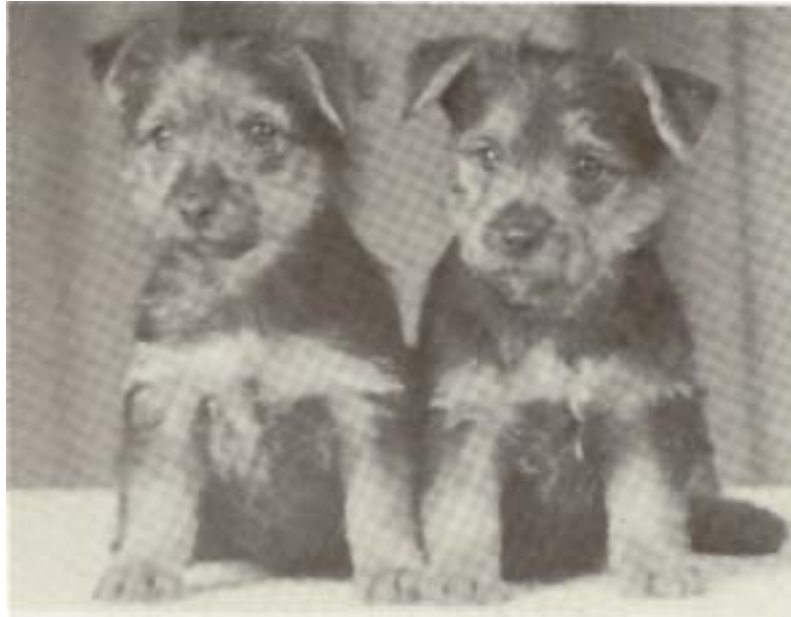
Wirrind Teddy Bear and Wirrind Snooky Bear, aged 9 weeks

In judging baby puppies and puppies up to around nine months of age you won't expect to find the correct real blue colour or texture and length of coat. Very often baby puppies will carry a blue-black coat which changes colour when the puppy is around nine months of age when you would penalise him for his black coat and certainly by this time he must possess a reasonable length of coat and certainly one that is starting to take on a harsher texture than his baby coat.