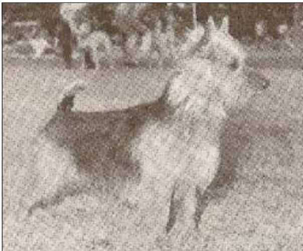
TYPICAL AUSTRALIAN TERRIERS

Remarks: The thumb-print has not been, to date, a judging point of the coat or furnishings. There is no similar characteristic in sandy/red Australian Terriers.