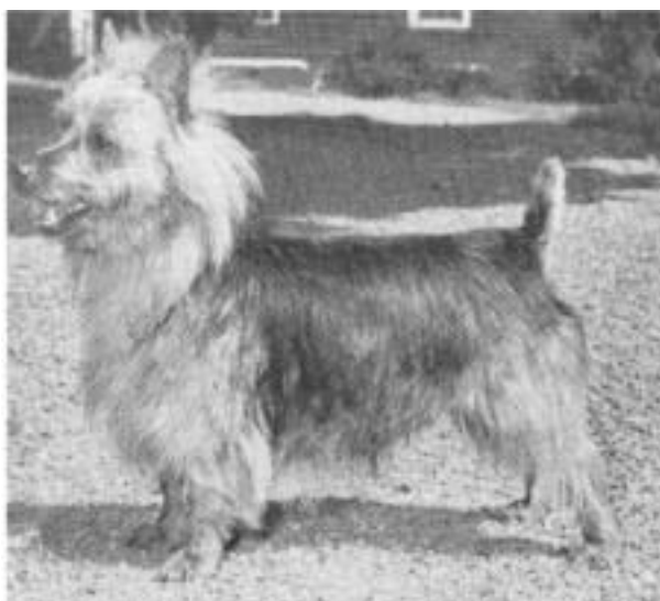
Fig. 14 Excellent specimen

! NOTE - Male animals should have two apparently normal testicles fully descended into the scrotum.