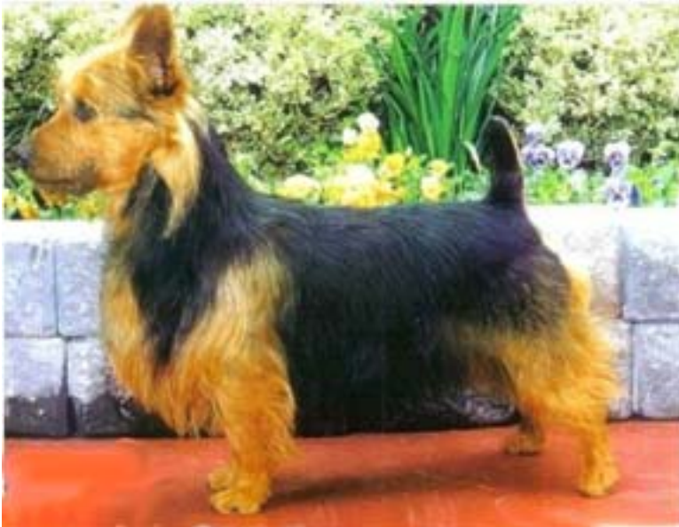
Figure 10 Mature Blue/Tan

There is a definite ruff around the neck extending to the breastbone, and a softer topknot of more silky hair on the head. These are two points that are distinctive characteristics of the breed. The outer coat is harsh to the touch – not harsh like the feel of a wire haired terrier, but more like the feel of coarse human hair. This outer coat must be straight to be typical. A curly or wavy coat would be inappropriate. The front legs are slightly feathered to the knee.