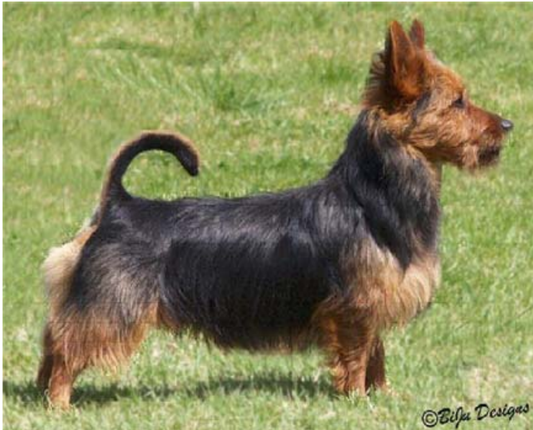
Figure 12 Young Blue/Tan