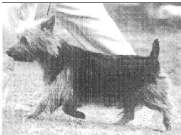
Figure 9 Movement

There should be no tendency to plait or weave with the forelegs. Rear movement should reveal hindquarters giving great drive and power, flexing well at the stifles and hocks. Side movement should reveal same hindquarter thrust being correctly transmitted to the forequarters. The topline should be level. To obtain the correct stance of the Aussie he should be handled entirely by the lead, not "topped and tailed", this confirms the description of alert, active and self-possessed.