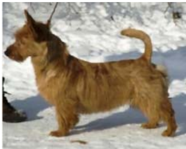
Figure 13 Young red